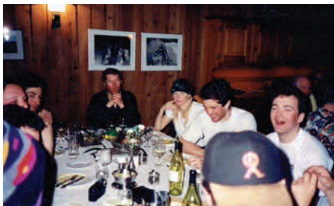
Dinner with Daryl Hannah & JFK, Jr.