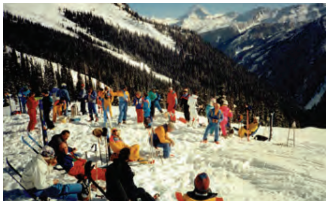
Lunchtime on the mountain.