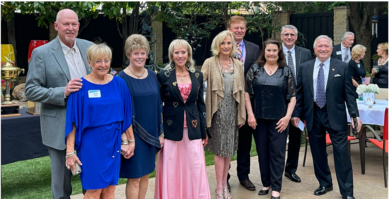
2022 - 2023 Board Members

Remember that your board members are here to serve you and would love to listen to new ideas that you might have!