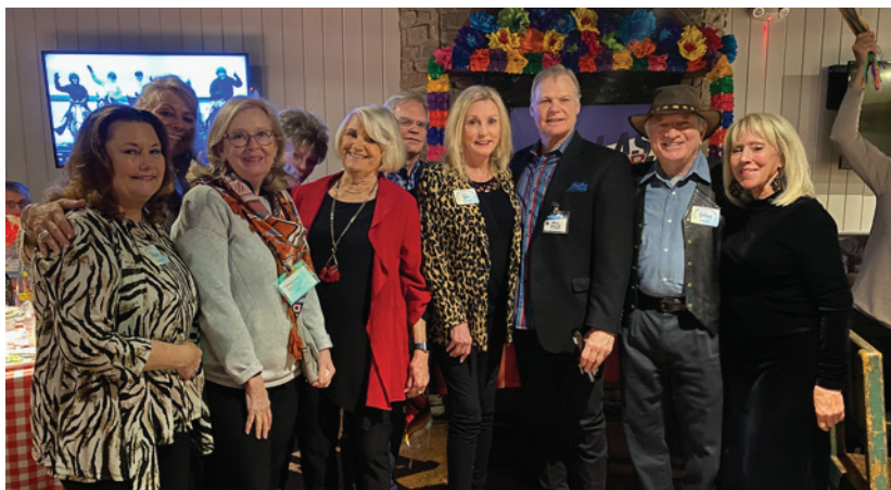
OUTGOING BOARD MEMBERS